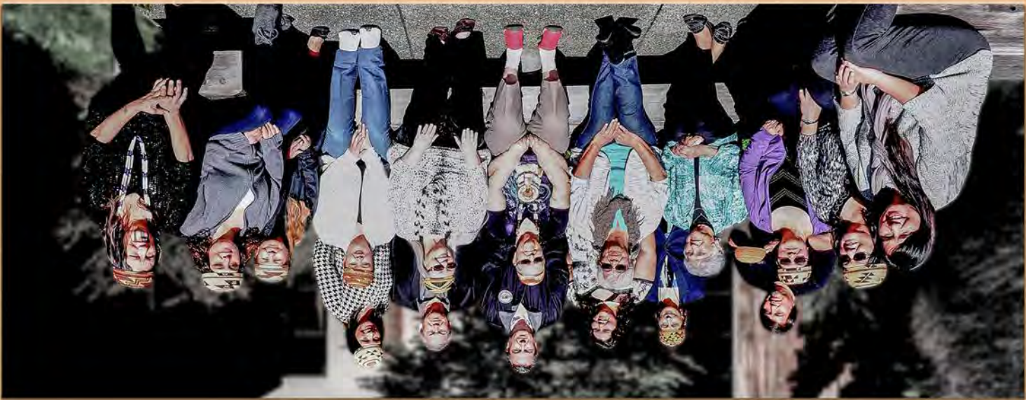
UIHS Board of Directors * 2017